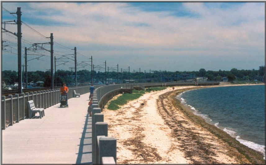
The Boardwalk extends 1,863 feet. Total Overlook length is 5,342 feet and includes its eastern (2,741 ft.) and western (738 ft.) pathways. The raised Niantic River Railroad Bridge is seen in the distance.